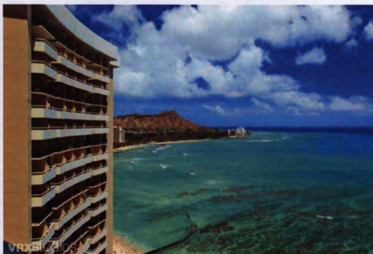
Sheraton Waikiki Beach view