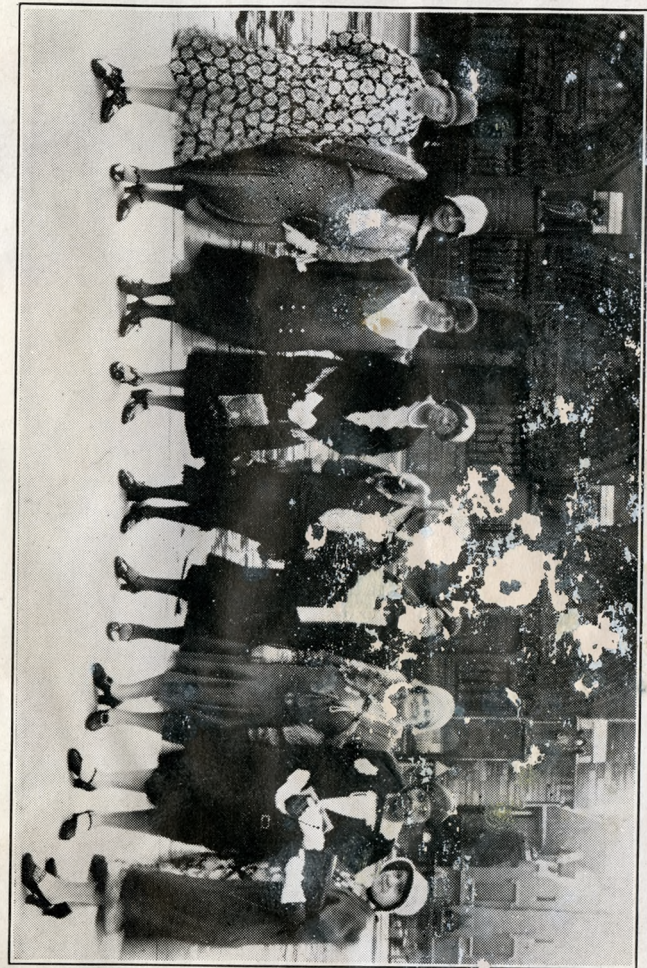
Delegation to International Council of Women, Before the Cathedral of Notre Dame, Paris, France