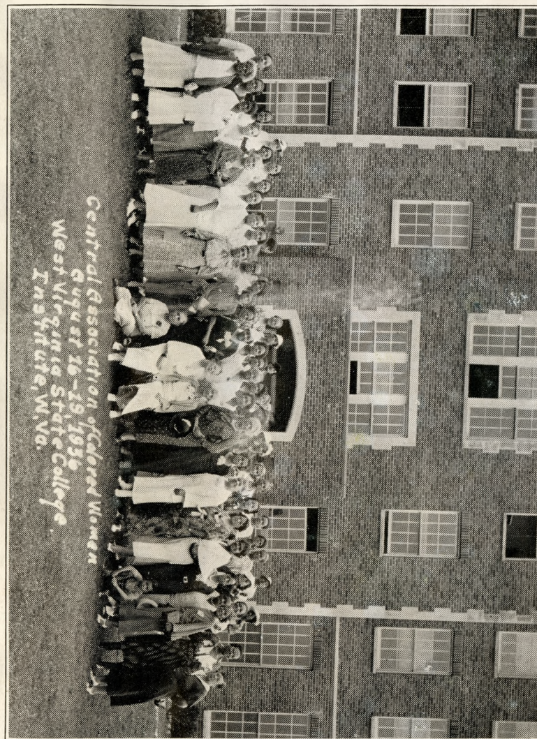
Central Association Delegation in Front of West Virginia State College, Institute, West Virginia, August 17, 1936