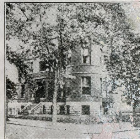
NATIONAL ASSOCIATION HEADQUARTERS Twelfth and O Streets, Washington, D. C.