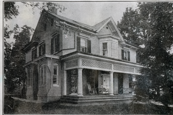
FREDERICK DOUGLASS HOME Anacostia, D. C.

Trustee and Advisory Boards of the Frederick Douglass Memorial and Historical Association, Inc.