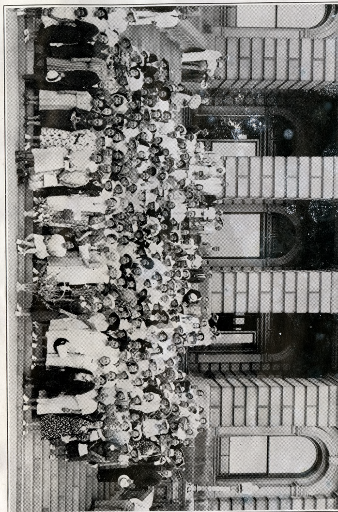
Central Association Delegation on State House Steps, Des Moines, Iowa, July 24, 1938