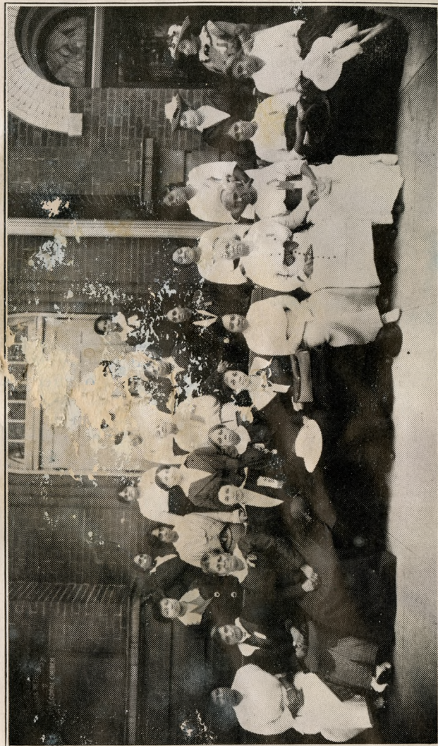
Delegation at Organization of Old Northwestern Association, Before St. Mark's M. E. Church, Chicago, August 16, 1915