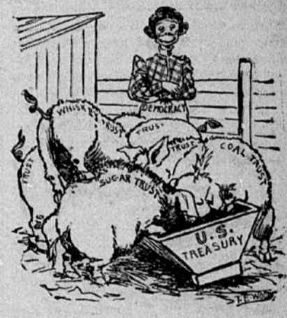
DEMOCRACY FEEDS HER FLOCK.