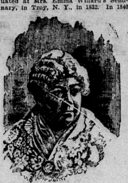
ELIZABETH CADY STANTON.

The new woman's bible has created a sensation and will sell as a novelty if for no other reason. It is already said that Elizabeth Cady Stanton is sorry that she undertook the work. The ridicule with which it is being treated by the papers has caused her much worry. Mrs. Stanton was born in Johnstown, N. Y., Nov. 12, 1815, and was graduated at Mrs. Emma Willard's Seminary, in Troy, N. Y., in 1832. In 1840