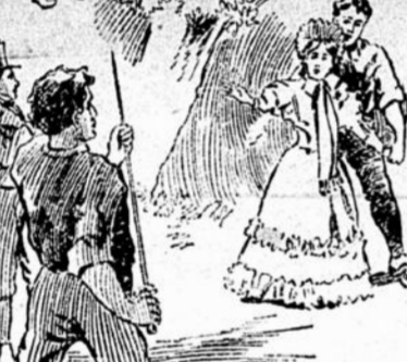
"I LOVE YOU, JACK."