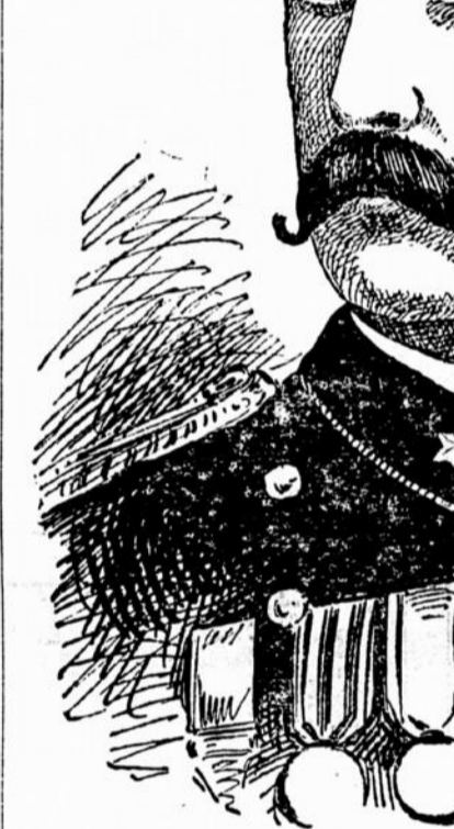
COUNT OF TURIN.

Princess Henri, after describing an interview between himself and the negus, continued: "Naturally the subject which was most often discussed was that of the