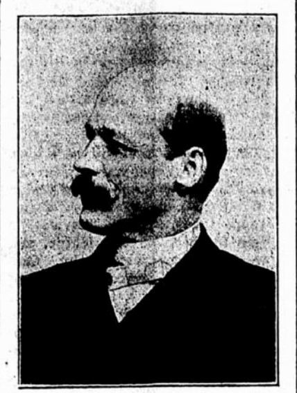
FOR CITY TREASURER.