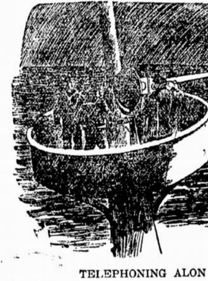
TELEPHONING ALONG A BEAM OF LIGHT.

"The most effective way to use a mine for coast or harbor defense that