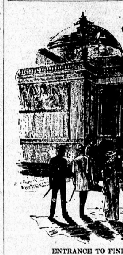
ENTRANCE TO FINE ARTS BUILDING.

Since the institution of the first primitive fair for the exchange of wares among ancient tradesmen, it has been grander and more interesting than its immediate predecessors. The Greater America Exposition will be no exception to this rule. In the variety and novelty of its educational and amusement features it will without question surpass the exposition of 1893. Its exhibits are not only more numerous, but more novel and instructive than were those of a year ago. The amusement concessions, also more numerous, present many novelties and all are grander in design and proportion than those of any former exposition. The illuminations and pyrotechnical displays will be upon a scale of magnificence heretofore not attempted, and a line of special features and days is contemplated of almost sensational interest.