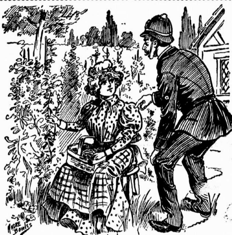
"WHERE'S THE YOUNG FELLOW GONE TO?"

A little maid in a blue cotton gown and a white muslin cap was picking