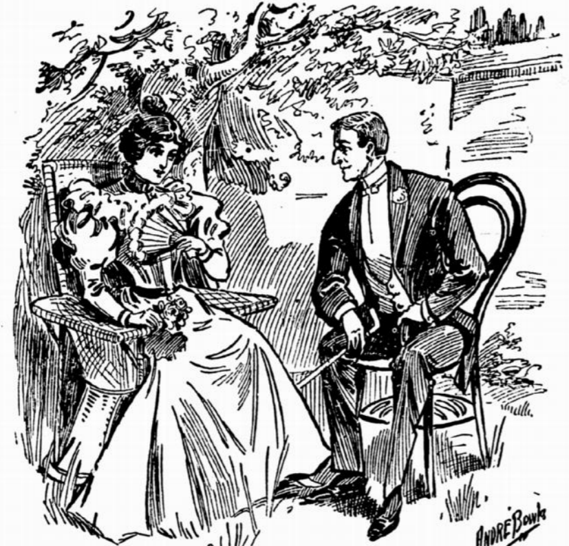
THERE WAS A MOST BEWITCHING SMILE UPON HER LIPS WHEN SHE REPLIED TO SOME REMARK OF HER COMPANION.

"Who is the fellow?" murmured the stranger, as he put up his eye-glass and surveyed the individual in question with an air of curiosity not unmingled with envy. "Her brother? Fiddlesticks! More likely her father!" with a shrug of his shoulders, though