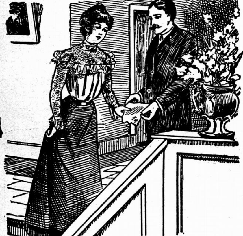
"OH, YES—IT—IT—IS MINE!"

in troubling himself so much about us and our concerns."