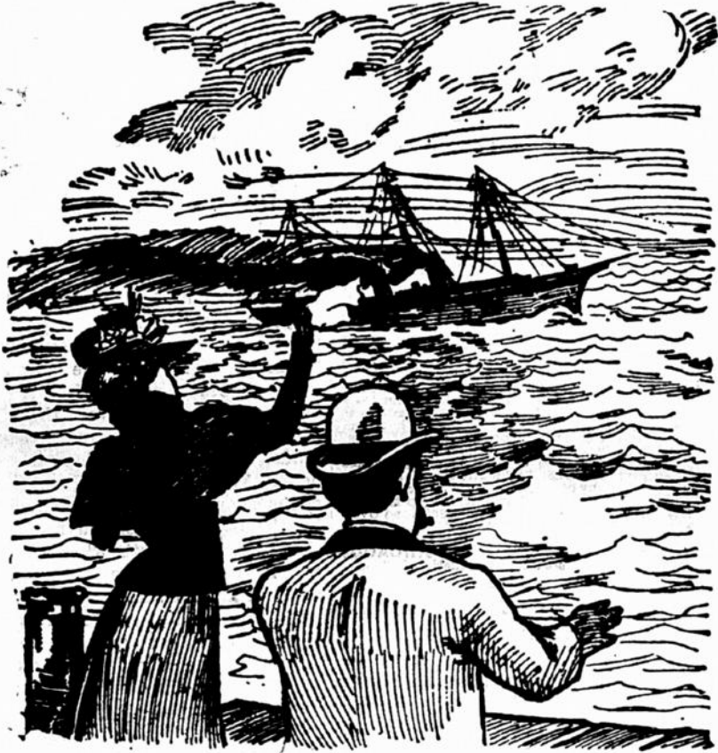
ON WEDNESDAY THE SHIP LEFT.

We are going to enjoy every foot of the way from here to Rio, and there he will be placed in good hands for the rest of the trip. He's all right. We sail on Wednesday. Don't forget."