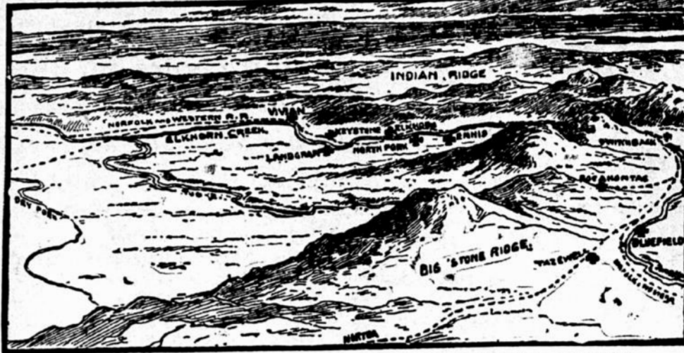
BIRD'S-EYE VIEW OF SCENE OF WEST VIRGINIA FLOODS.

The scene of the worst part of the flood was the Valley of the Elkhorn, in McDowell county, in the southwestern part of West Virginia. Another valley to the south of this one