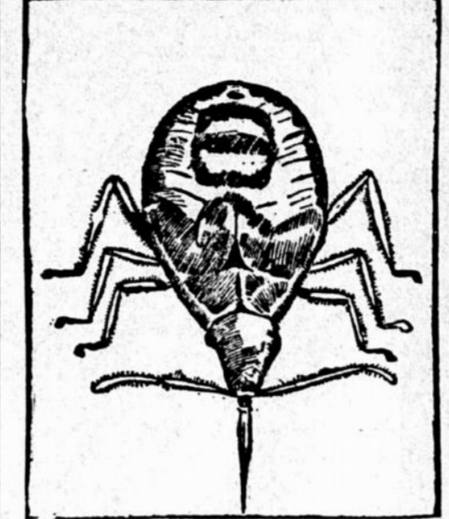
THE CATERPILLAR'S ENEMY.

IT IS A BUG ERRANT. Nature has once more proved that she knows how to manage affairs in