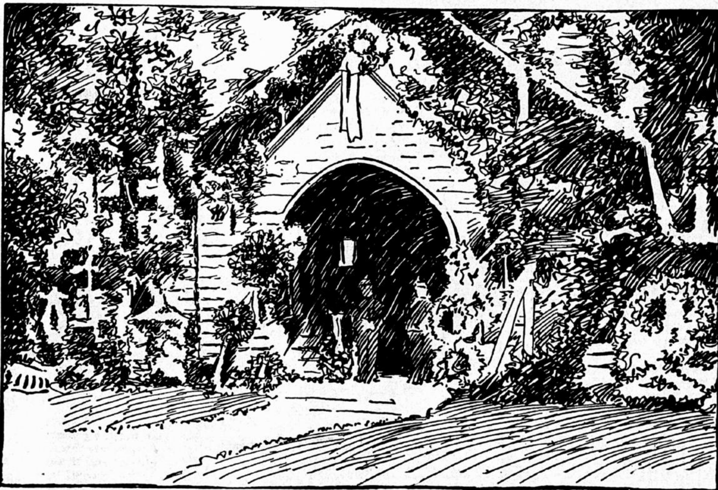
THE TOMB OF THE LATE PRESIDENT M'KINLEY AT CANTON—FROM A PHOTOGRAPH TAKEN THE DAY OF THE FUNERAL.

Those Americans who filed out of Westminster Abbey all possessed of the idea that there should be one burial place for American presidents were singularly indifferent to the most impressive feature of President McKinley's funeral. Perhaps if they had been a little nearer home themselves they might then have caught the full meaning of that last home-coming.