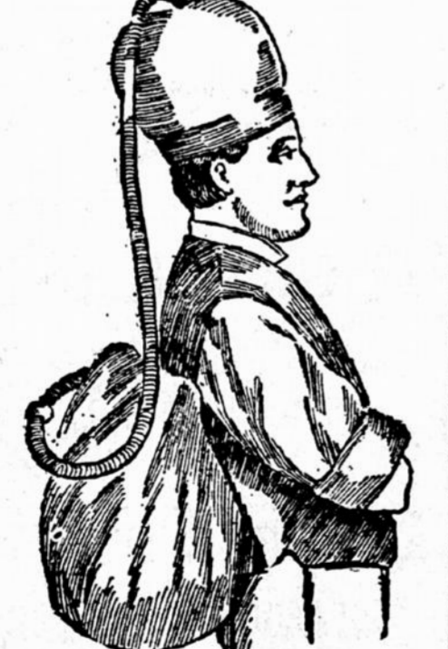
APPARATUS FOR CURING BALDNESS.

The use of gas to make the hair grow is one of the latest medical discoveries. The gas employed is oxygen. A large cap fits tightly round the head and is supplied with oxygen from a bag which is slung over the patient's shoulders. It is worn for a few hours every day, and even in cases of absolute baldness, it is said to produce a more or less luxuriant crop of hair. The discovery was made at the Oxygen hospital, London. The gas is used for the cure of quite a number of diseases. A woman was undergoing the oxygen cure for skin disease, and one of her arms had been for many days placed in a light, air-tight box filled with the gas. It was soon noticed that on the part of the arm that was unaffected by the disease the growth of hair was much stimulated, and this naturally suggested oxygen as a cure for baldness. The first experiment was made upon a woman who had completely lost her hair, and