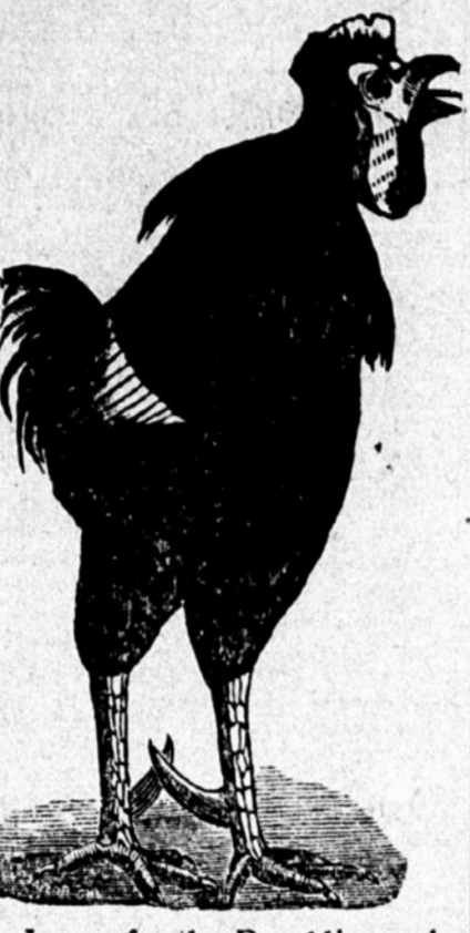
I crow for the Republican victory in county, state and nation.