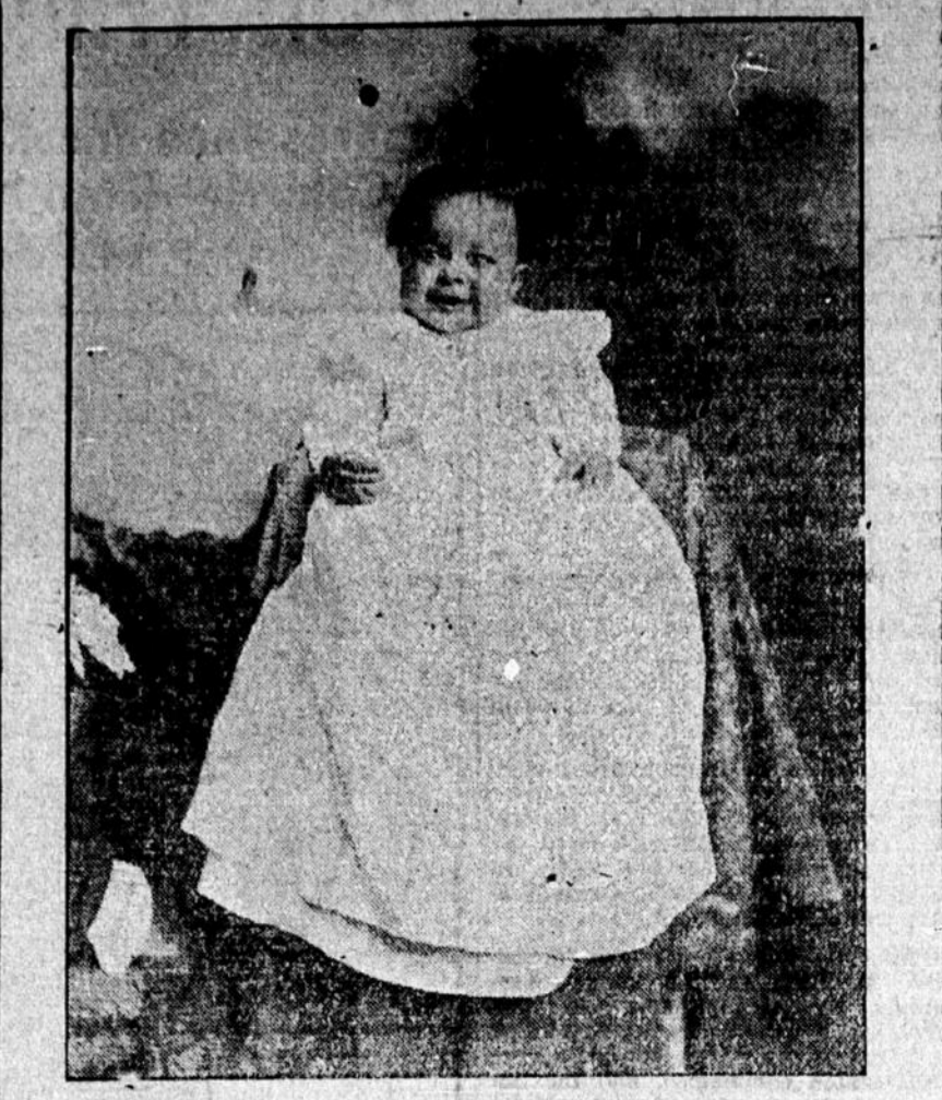
DES MOINES HAS A PRIZE WINNING COLORED BABY.