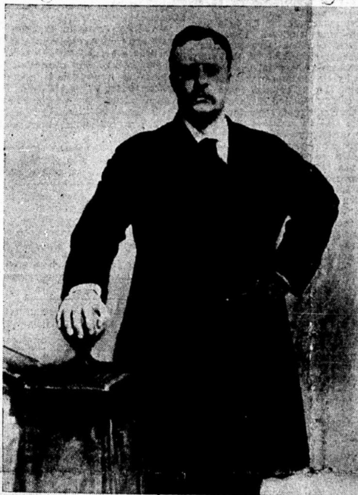
ON TO WASHINGTON.