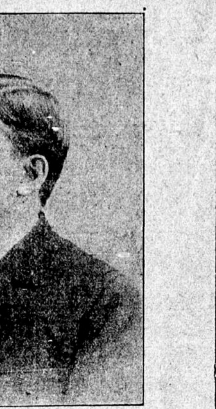
HONORABLE JONATHAN P. DOLLIVER Senator re-elected from Iowa.