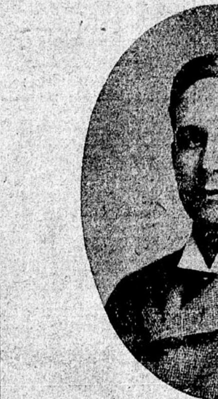
HONORABLE N. E. KENDALL Unanimously elected speaker of the 32nd General Assembly of Iowa legislature.