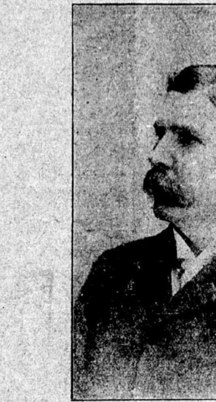
HONORABLE JONATHAN P. DOLLIVER Senator re-elected from Iowa.