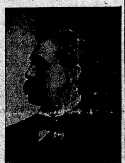
HON. ALBERT B. CUMMINS. Inaugurated Governor of Iowa for third time.