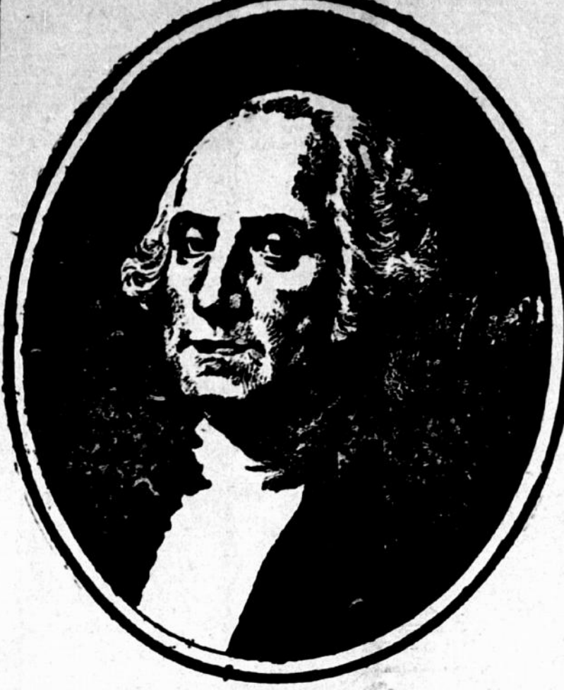
GEORGE WASHINGTON. First in War, First in Peace and First in the Hearts of His Countrymen.

That little dimpled cheek will not allow you to take off your uniform for a single day. You must build his home. You must fight for his inheritance. You must put your life into the moving and marching forces of righteousness that are trying to win victories for him. The next generation will live in the country which this generation is making for it. And each one of us is helping to make it. All of us are nation-builders. Every time we cast a ballot for an unclean office-seeker we are committing an outrage upon the future.