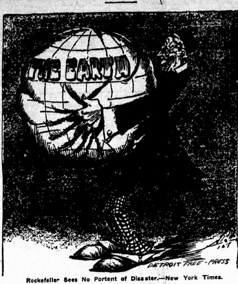
Rockefeller Sees No Portent of Disaster.—New York Times.