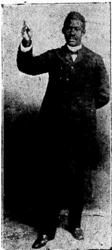
A Noted Evangelist.

We received this week a copy of The Denver Republican, Sunday edition of 54 pages, very highly illustrated. In fact but few of our great modern Eastern journals equals it. In that issue