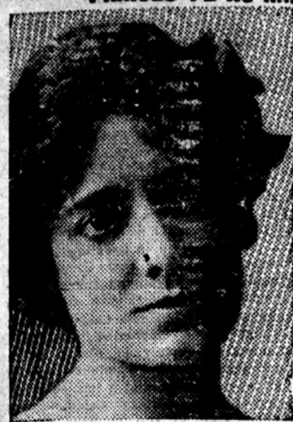
MISS JULIA MARLOWE.

"I am glad to write my endorsement of the great remedy, Peruna. I do so most heartily."—Julia Marlowe.