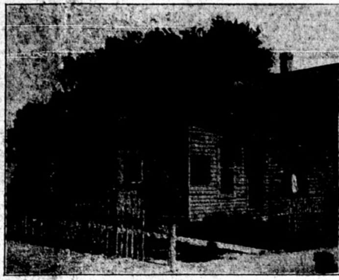
UNION CONGREGATIONAL CHURCH BUILDING, July 1904.

A Strong Appeal. Almost modern is the Persian story of the man whose disagreeable voice in reciting his prayers in the mosque was annoying to everyone. One day some one asked him how much he was paid for reciting. "Paid!" he replied. "I am not paid. I recite for the sake of Allah!" "Then," replied the other "for Allah's sake don't!"