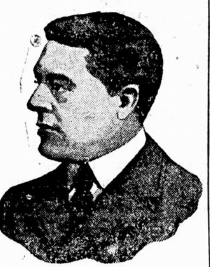
George B. McClellan.