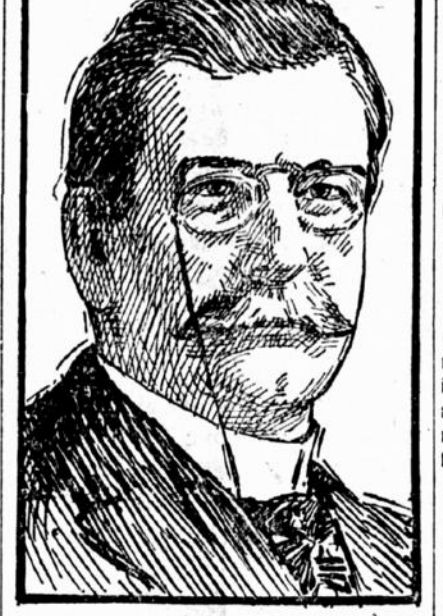
Luke E. Wright.

The formal transfer of the war department from the administration of Secretary Taft to that of Secretary Luke E. Wright, his successor, did not take place until Wednesday, but the work of the department was brought up to date by Mr. Taft before he left his desk Tuesday evening and Secretary Wright entered upon his