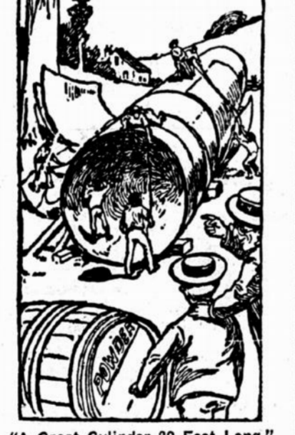
"A Great Cylinder 30 Feet Long."

The next day they opened the casks of powder and began to load it in and in, hour after hour, until the last grain