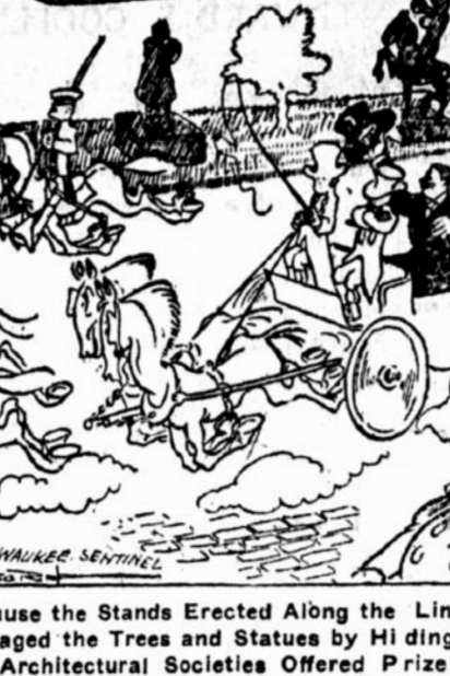
Because the Stands Erected Along the Lines of the Inaugural Parade Damaged the Trees and Statues by Hiding These Ornaments Washington Architectural Societies Offered Prize Designs for Stands.—News Item.