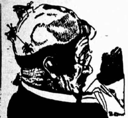
First Mountain Climber—Come on, fellows; we're above the timber line and will soon be on the summit.

Ethergram. Language grows apace with the victories of applied science.