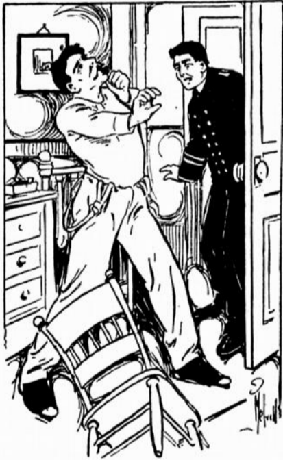
There in the Middle of the Room Was the Man Who Did Things Twice.

What was the meaning of it? Henry Hobart had died and his body had been mutilated by the surgeon's knife. How,