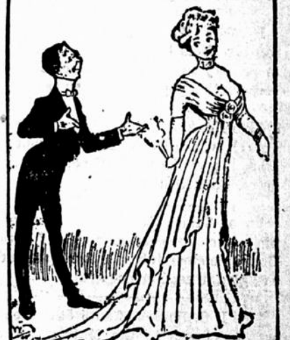
The Rejected—And will nothing make you change your mind? She—Yes, another man might.