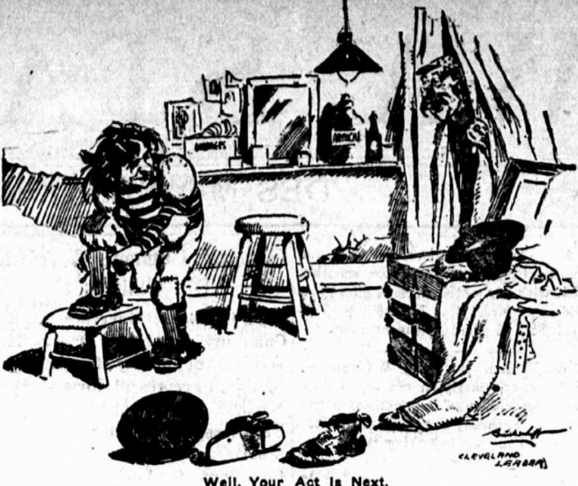
Well, Your Act Is Next.