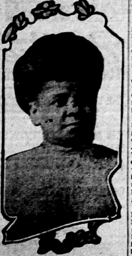
MRS. IDA WELLS BARNETT.

The following report on lynching in the United States for the past twenty-seven years was given by Mrs. Ida Wells Barnett at the recent conference on the status of the American Negro which was held in New York. Mrs. Barnett said: "From its first manifestations in 1892, in which fifty-two persons were lynched, down to the present lynching has been along the color line. Mob murder increased yearly until more than 200 victims were lynched in 1902, and statistics show that 3,254 men, women and children have been put to death in this quarter of a century. During the last ten years, from 1900 to 1909 inclusive, the number lynched was 996. Of this number 102 were white, while the colored victims numbered 897. "No other nation, civilized or savage, burns its criminals. Only under the stars and stripes is the human being burned at the stake, one of them a woman and two of them children, is the awful indictment against American civilization—the gruesome tribute which the nation pays to the color line. "Why is mob murder permitted by a Christian nation? What is the cause of this awful slaughter? This question is answered almost daily—always the same shameless falsehood that 'Negroes are lynched to protect woman-