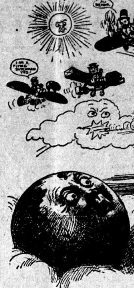
AND IT'S NOT A FLIGHT OF FANCY.