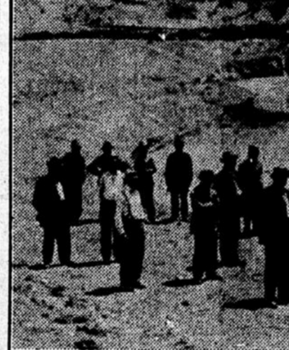
Along the South Canal.

There is no dam across the Black canyon at the point where the river is turned into the tunnel. Instead of this the tunnel itself taps the river from beneath its granite bed. By this plan neither floods nor slack wa-