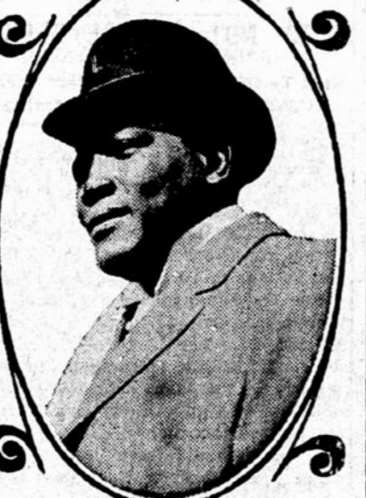
LATEST PHOTO OF JACK JOHNSON, WORLD'S HEAVYWEIGHT CHAMPION.

Champion Likely to Meet Langford Before He Tackles Jeffries. Now that Jack Johnson, the world's heavyweight champion, has disposed of another aspirant for his title, fight followers the country over are clamoring for Jim Jeffries to meet him in the ring. If the pair meet it should result in one of the greatest fist encounters ever held. Before the champion meets Jeffries he intends taking on Sam Langford, the Boston warrior.