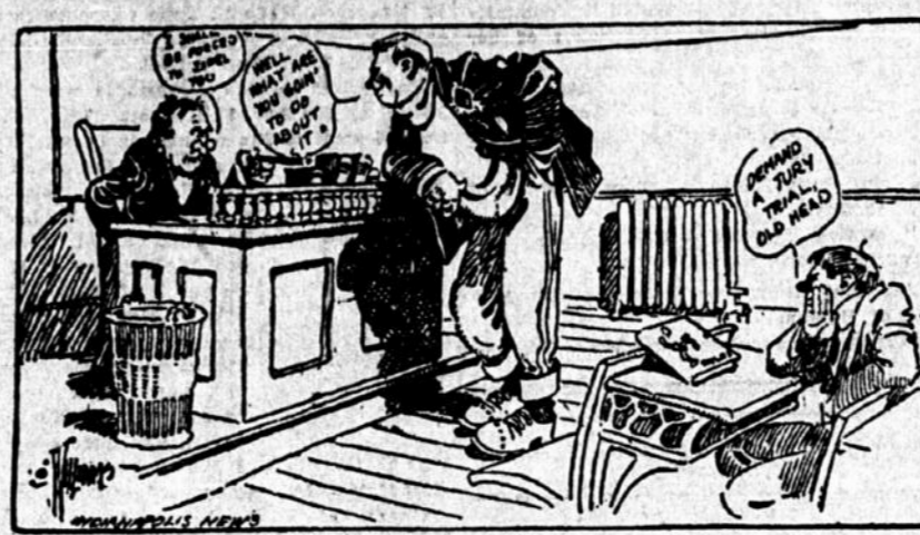
YESTERDAY AND TODAY.