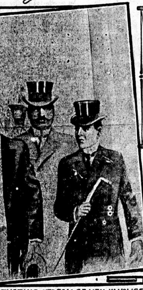
A FLUCTUATING STREAM OF MEN IN HOLIDAY ATTIRE