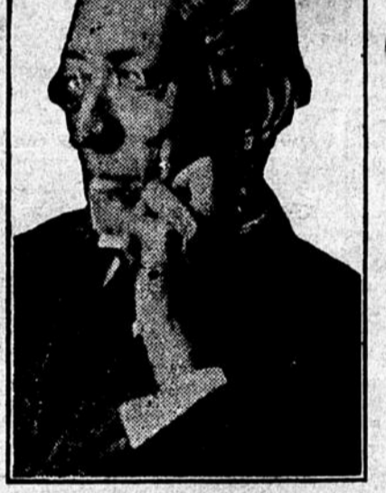
T. THOMAS FORTUNE.