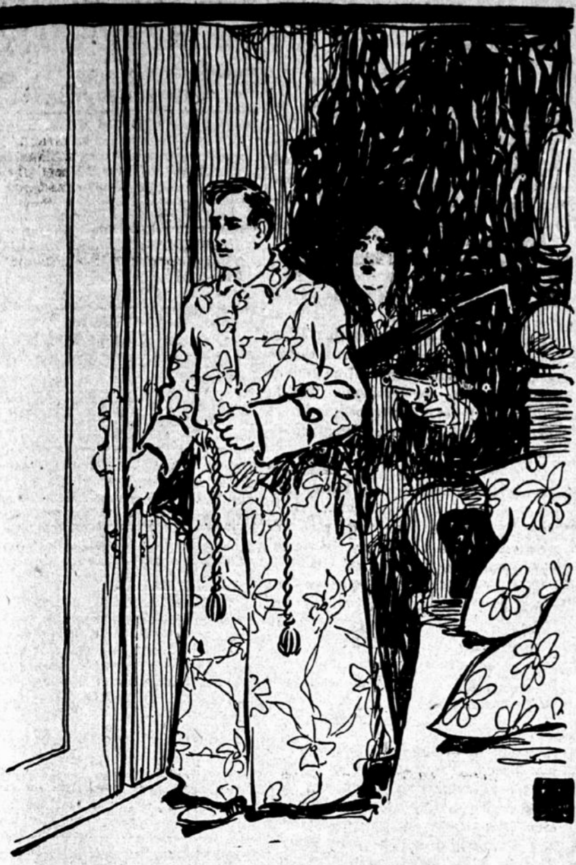
We Turned to the Folding Doors Again.