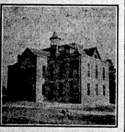
BOYS' DORMITORY AT WATERS NORMAL INSTITUTE.