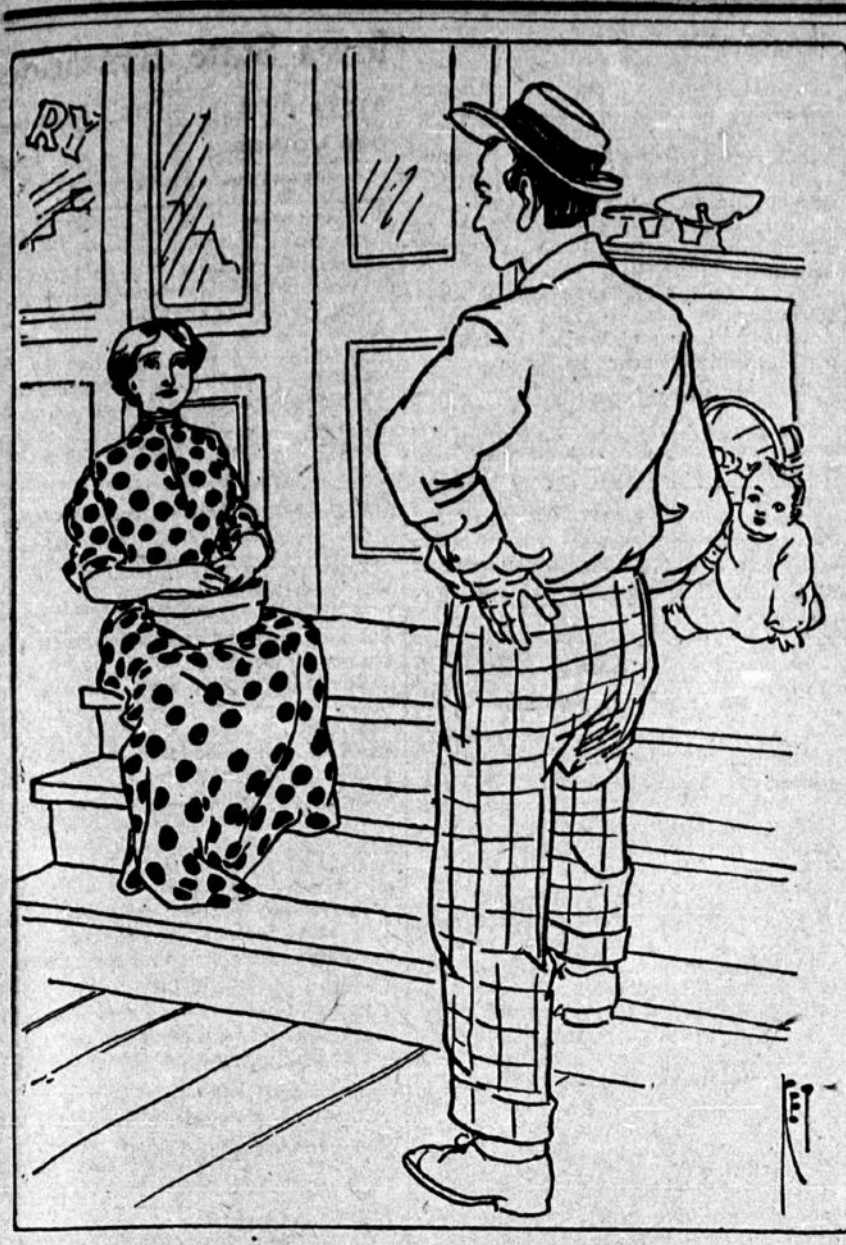
"How on Earth Did They Get Along, Without You Before You Came?"