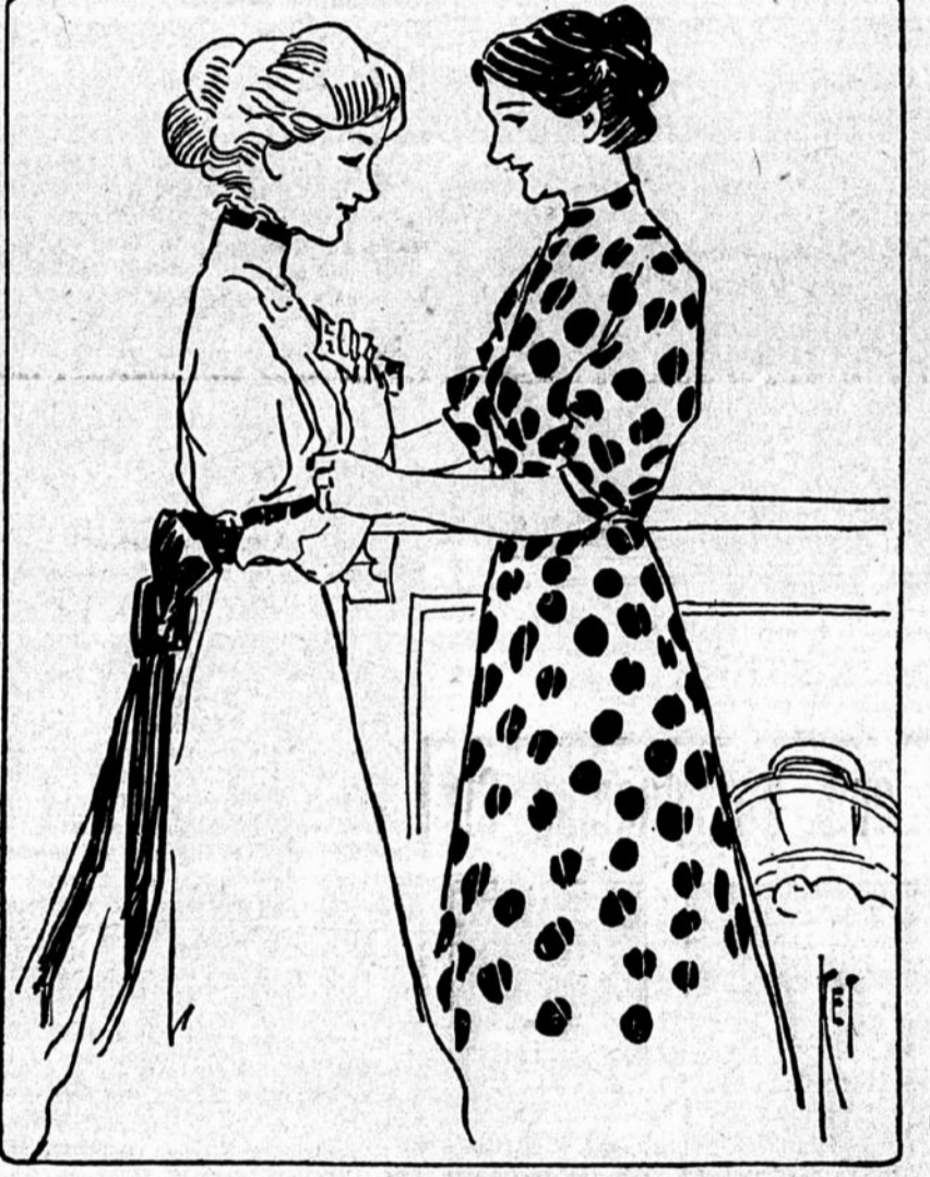
"Jest Hold to the Thought of His Forgiveness, and Don't Never Give It Up."