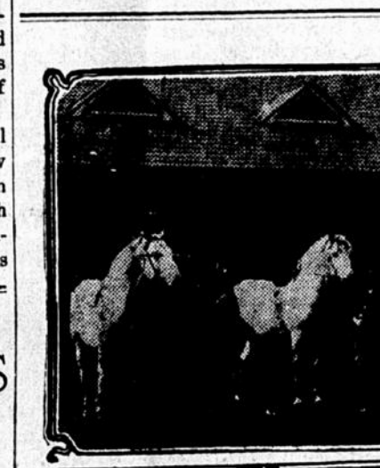
Price Winning Percherons at Iowa State Fair, last week of August.

Willing to Oblige. "When you feels any temptations comin' along," said the friend and adviser, "you mus' say: 'Get thee behin me, Satan.'"