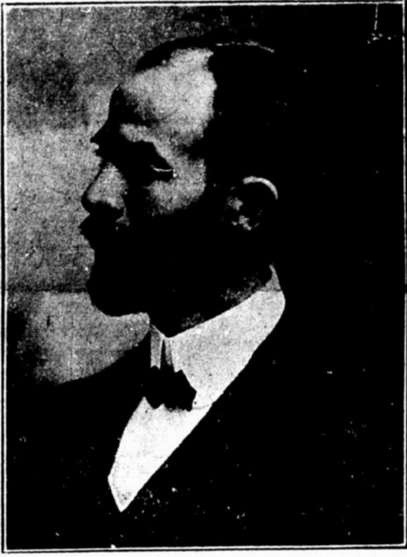
PERRY GREELY HOLDEN, Candidate for the Nomination of Governor of the State of Iowa.

I respectfully ask for the votes of the citizens of Des Moines at the coming municipal primary and election. If elected, I pledge my time and best service in the interest of all of the people of the city. I will not be under obligation to or draw pay or salary from any other source during my term of office. I will insist upon an orderly, decent and efficient business administration of city affairs in all departments and the enforcement of all laws and regulations looking to the physical and moral betterment of our people. I will insist that the money exacted from the people in taxes shall be expended for the benefit of all the people and equitably distributed over the city.