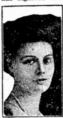
She has become a disciple of the latest custom among the members of the higher circles of the fatherland and elsewhere—that of living in the fashionable hotels or boarding houses.

Crown Princess Cecille of Germany has signified her intention never to keep house again.