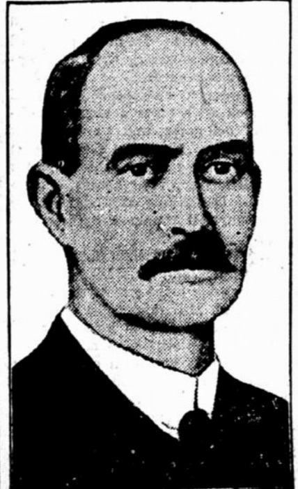
David F. Houston, Secretary of Agriculture.

The federal government expects to receive about $650,000 for the timber,