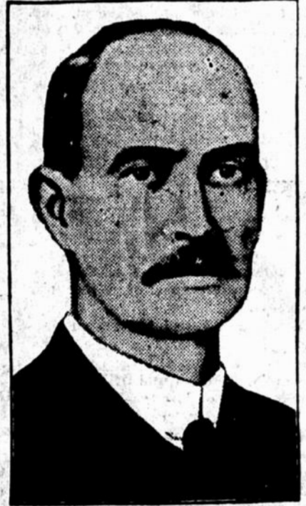
David F. Houston, Secretary of Agriculture.