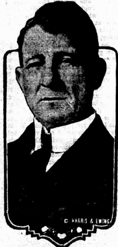
Senator Harry Lane.

Congress put the tax-free denatured alcohol on the statute books, but Americans are doing practically nothing to develop the industrial alcohol industry. Why have farmers not taken to the denatured alcohol idea?