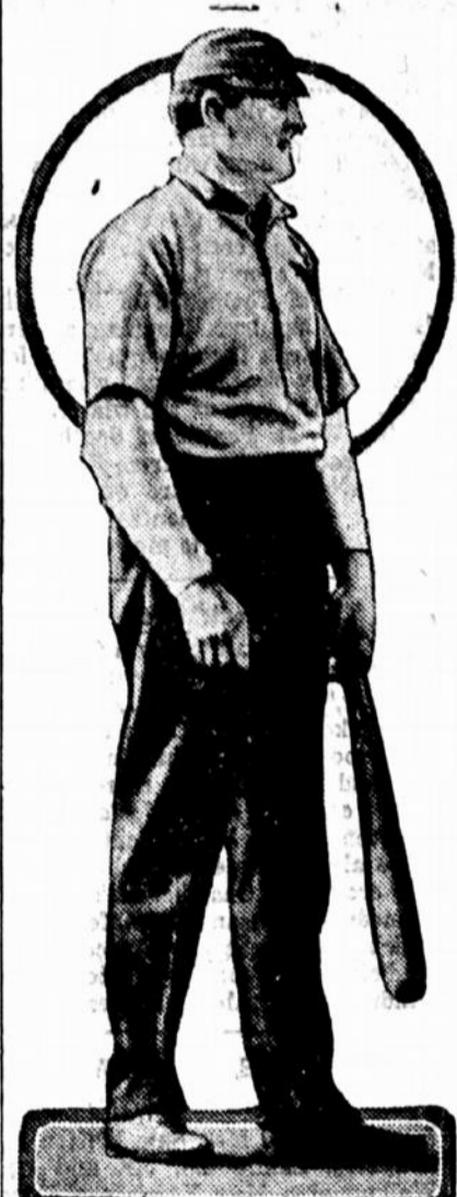
Gov. John K. Tener of Pennsylvania.

Gov. John K. Tener of Pennsylvania, who was recently elected president of the National league at a salary of $25,000 per annum, in an interview said that the game must be kept clean; that it needed no doctor, and that umpires should rule the field.