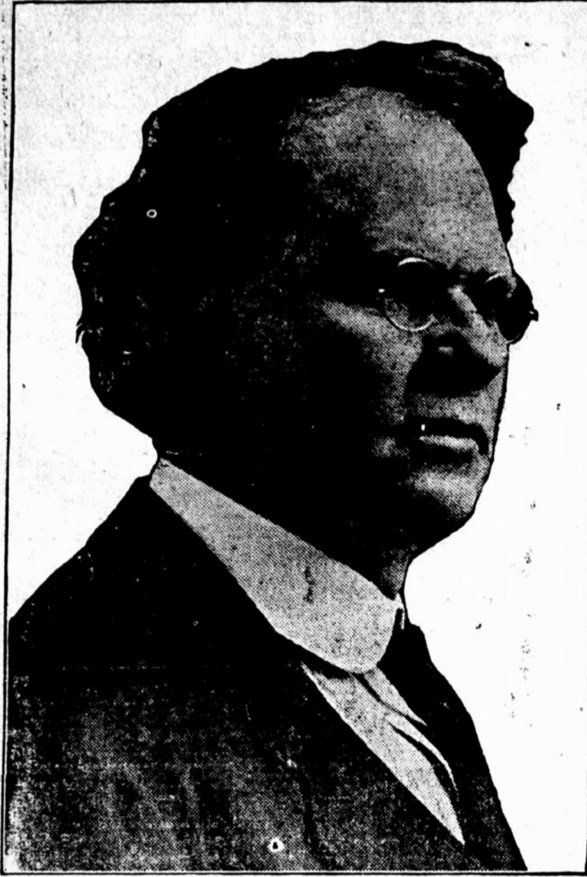
JUDGE C. G. LEE Of Story County

Candidate for Republican Nomination for GOVERNOR OF IOWA Primary, Election June 1, 1914