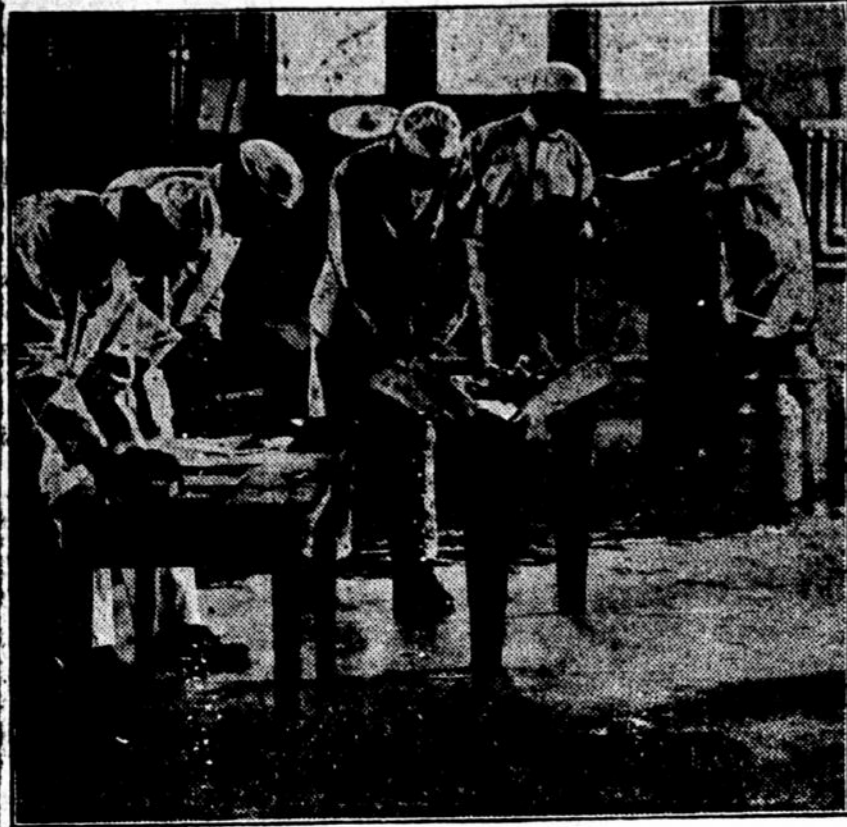
Hampton boys learn how to care for milk, make butter and cottage cheese, and handle cows to the best possible advantage.