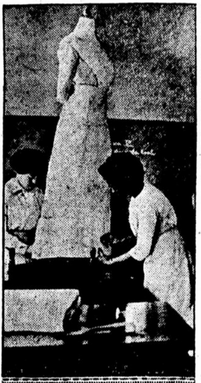
Students Learn Art of Dressmaking.