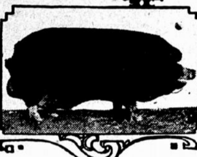
CHAMPION POLAND CHINA BOAR AT THE IOWA STATE FAIR, AUG. 23 TO SEPT. 4.