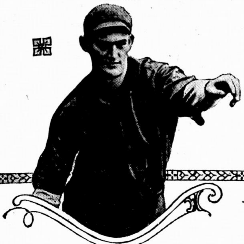
George Tyler, Star Southpaw Twirler of Boston Braves.

"Two years ago he couldn't stay steady for two minutes," said Manager George Stallings recently, while discussing George Tyler, his star left-hander. "If he got one ball on a batter he would hitch his pants, pull nervously at his cap and kick and scratch like a chicken. But you ought to see him now, especially against the Giants. He is coolness personified and the hotter the pinch the happier he is and the better he pitches."