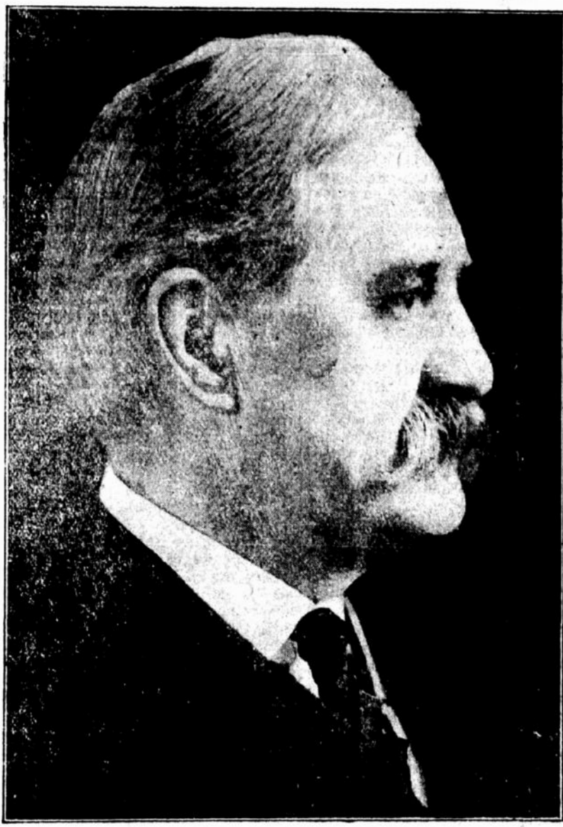
HON. ALBERT B. CUMMINS Who was triumphly re-elected U. S. Senator from Iowa. He is our choice as Republican candidate for president of U. S. in 1916