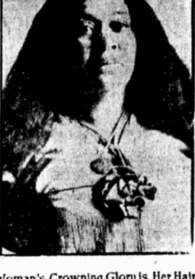
Woman's Crowning Glory is Her Hair