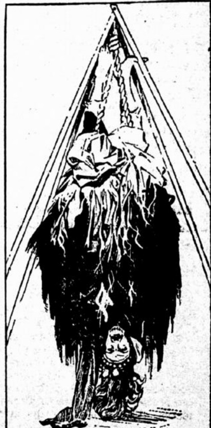
From a Photograph Taken While the Fanatic Was Hanging.

"In an ecstasy of loyalty," writes a correspondent, "he hung himself up by his feet directly he heard that the prince and the princess of Wales were to visit India, the act being designed to prove his gratitude for the