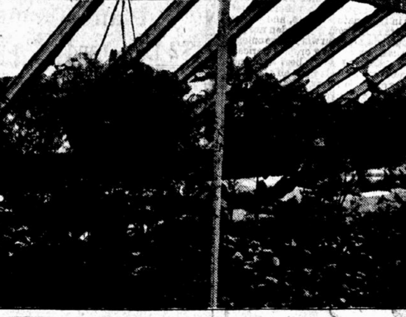
Asparagus Sprengeri is Easily Grown and Makes a Most Graceful Basket Plant for Veranda Decoration. Get the Hanging Baskets Ready.