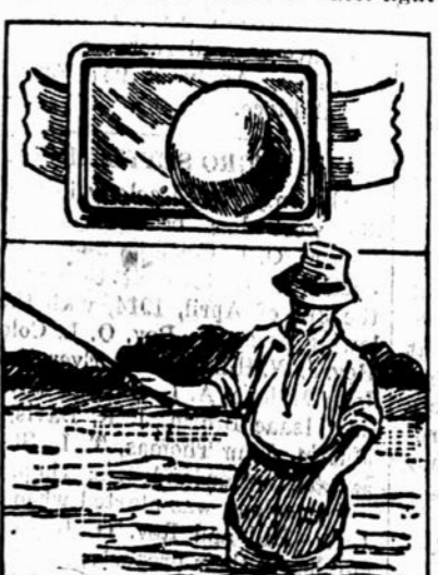
Belt Vault for Bathers and Fishers.

Made large enough so that it may be used to carry cigarettes and matches, or personal jewelry, including a man's-size watch, a water-tight