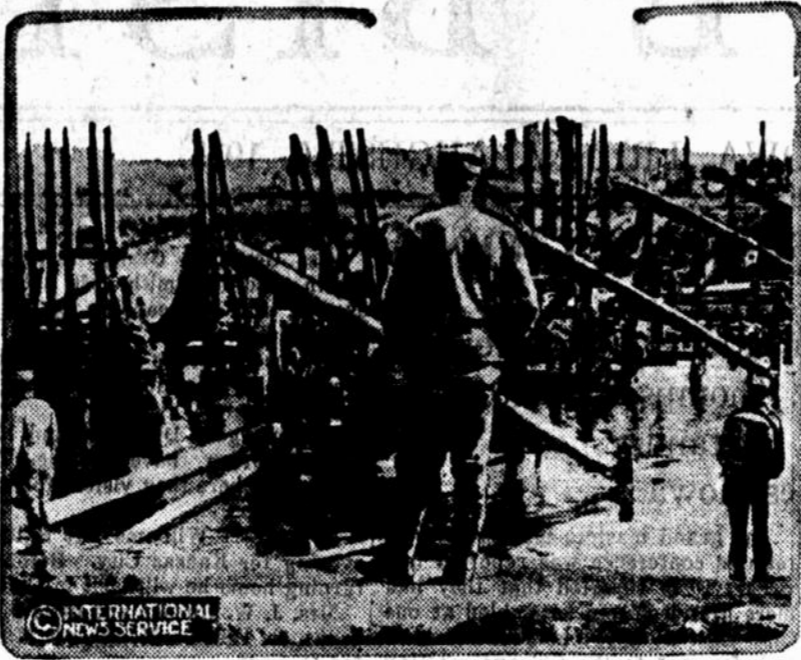
This photograph, taken during the retreat of the Russians through Galicia, shows Austrian troops repairing bridges.