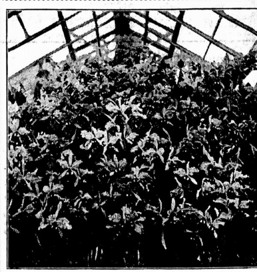
Get Only Plants Adapted to the Window Garden for Winter Blooming.

In the mild climate of California and some of the southern states, daisies bloom all the year around. In California these flowers grow very much larger than those of the East, as do all Pacific coast flowers; but they seem to lack brilliancy, and to many persons are not as satisfactory. Luther Burbank developed the Shasta daisy to a very large and beautiful flower and this is largely taking the place of the Marguerite or Paris daisy which has long been a favorite with Californians. In the colder climates, of course, it is impossible to keep daisies blooming every month; but by planting different varieties some of them may be kept blooming nearly the entire summer. The daisy is really not a domesticated flower, as a great many low-growing wild flowers are called daisies. Many varieties are classed as weeds. In fact, the ox-eyed daisy, which is plentiful all through New England and some of the northern states, is called white-weed. The chrysanthemums and wild asters are called daisies and really belong to the same family. While it would not be possible perhaps to have a daisy hedge in bloom all the year, still by planting the various species of daisies, chrysanthemums and asters some bloom could be had from April to November.