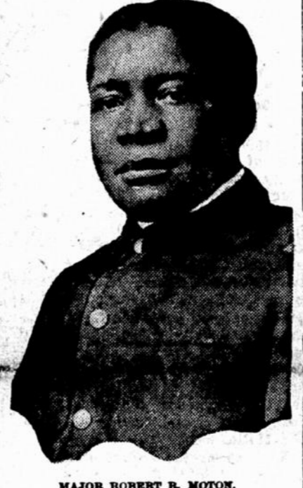
MAJOR ROBERT R. MOTON.

Major Robert R. Moton and Party of Distinguished Citizens Receive Warm Welcome at Every Point on Tour of Northern Neck—Interest in the Movement Increases. Hampton, Va.—The Negro Organization Society of Virginia recently concluded a successful campaign through the Northern Neck in the interest of "better health, better schools, better farms, better homes." This was the third Virginia campaign. It showed clearly that white and colored people alike are waking up to the importance of public health, education, economic prosperity and wholesome home life. President Robert R. Moton and his party of race leaders were everywhere received most cordially. In the region between the Rappahannock and Potomac rivers, embracing Northumberland, Lancaster, Richmond, Westmoreland and Essex counties, there are many colored people living in attractive and well kept homes, which they own, and worshipping in